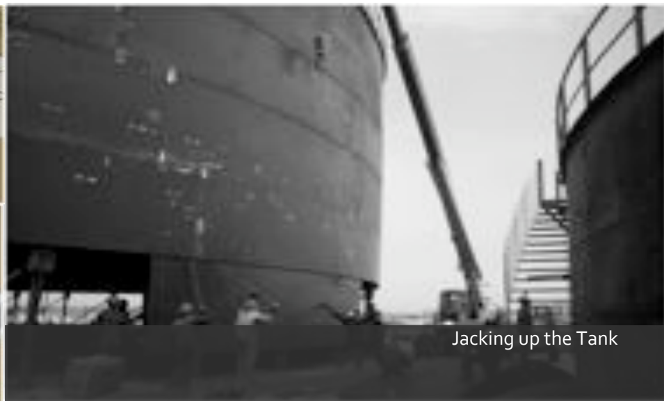
Jacking up the Tank